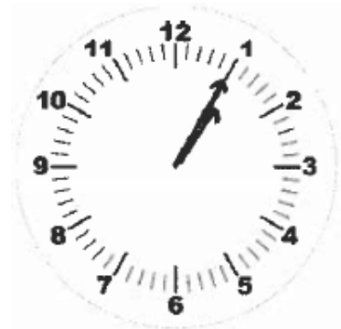
Viis minutit üks läbi.