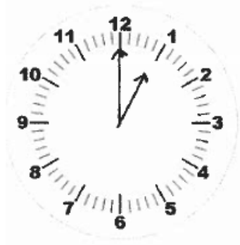
Kell on üks.

The following expressions show how to tell the time in Estonian: