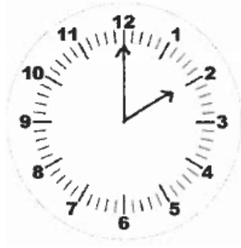
Kell on kaks.